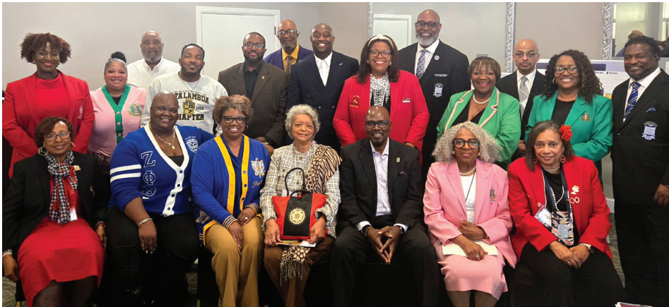
Pictured above are representatives from the Indianapolis Coalition on Educational Equity and guests